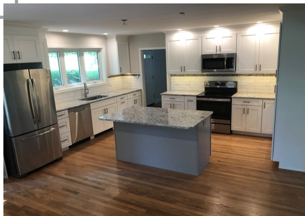
After renovations, July, 2020.