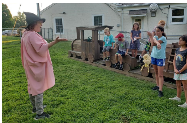
We had a magical VBS for our children in August

The 2022 Stewardship Campaign will begin this Fall. Until then, think about what St. John's means to you and your family and pledge according to that and your means. Please also consider what time and talent you can provide. And, as always, please share your ideas and concerns. After all – "We are St. John's!"